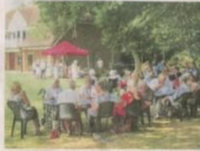
U3A members enjoy the summer sunshine

It also organises local walks, pub lunches, Explore London guided walks, and a programme of monthly outings to places of interest, including theatres, concerts, National Trust properties and museums.