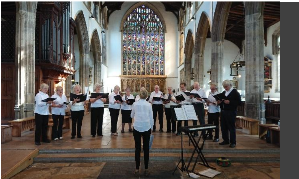
Photo credit: K. Gauntley, CCT (Churches Conservation Trust), St. Nicholas Chapel, King's Lynn, Norfolk.